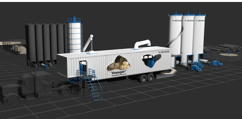
FIGURE 1. The Voyager unit offers operational efficiencies, short manufacturing time and advanced chemistries in a small footprint.

The Voyager unit aims to eliminate additional transportation time and cost by resin-coating sand where the operational cost is the lowest. With a mobile unit deployed at an in-basin mine, transloading costs are avoided